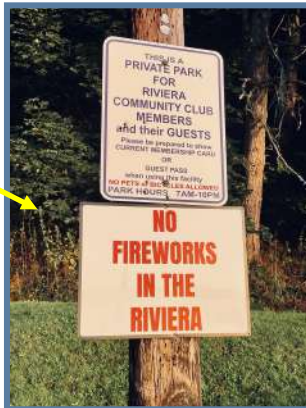
NO FIREWORKS signs were replaced in all the main Riviera parks, campground & marina.