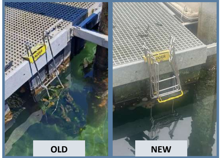
A ladder on one of the marina floating docks was replaced.